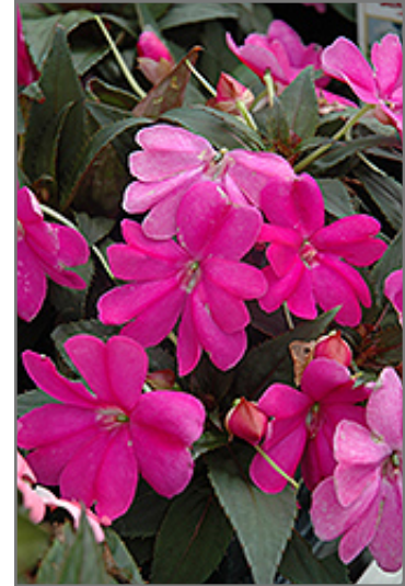
SunPatiens Compact Lilac New Guinea Impatiens flowers

SunPatiens Compact Lilac New Guinea Impatiens is recommended for the following landscape applications;