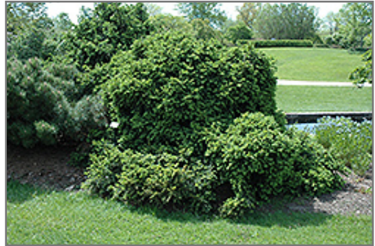
Clanbrassiliana Spruce

Clanbrassiliana Spruce will grow to be about 10 feet tall at maturity, with a spread of 8 feet. It tends to fill out right to the ground and therefore doesn't necessarily require facer plants in front, and is suitable for planting under power lines. It grows at a slow rate, and under ideal conditions can be expected to live for 50 years or more.