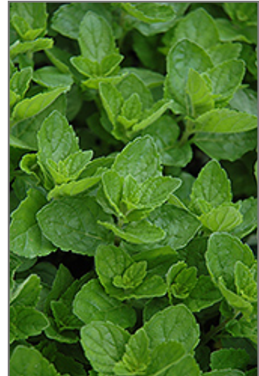
Spearmint foliage