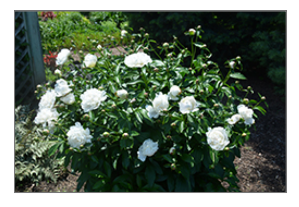
Festiva Maxima Peony in bloom