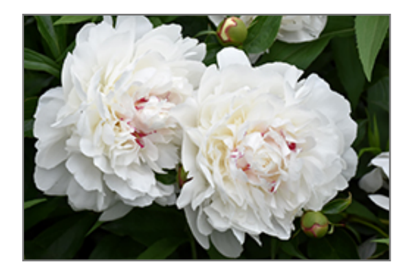
Festiva Maxima Peony flowers