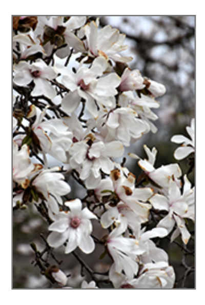
Merrill Magnolia flowers

This tree does best in full sun to partial shade. It requires an evenly moist well-drained soil for optimal growth, but will die in standing water. It is not particular as to soil type, but has a definite preference for acidic soils. It is quite intolerant of urban pollution, therefore inner city or urban streetside plantings are best avoided. Consider applying a thick mulch around the root zone in winter to protect it in exposed locations or colder microclimates. This particular variety is an interspecific hybrid.