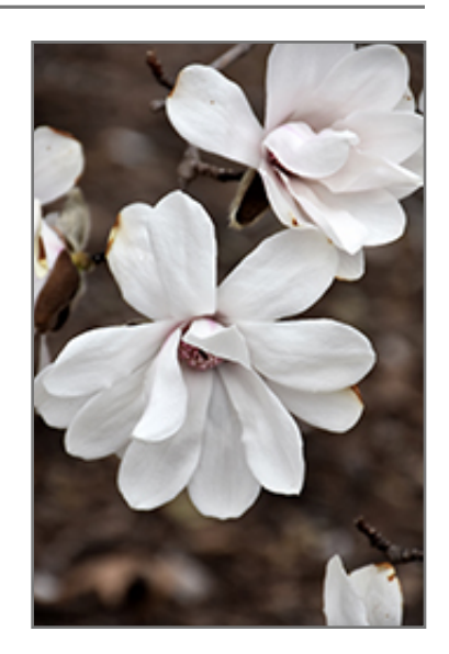
Merrill Magnolia flowers

Merrill Magnolia will grow to be about 25 feet tall at maturity, with a spread of 30 feet. It has a low canopy with a typical clearance of 5 feet from the ground, and is suitable for planting under power lines. It grows at a medium rate, and under ideal conditions can be expected to live for 80 years or more.