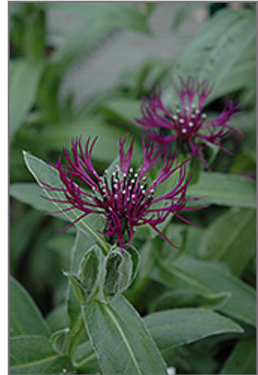
Amethyst Dream Cornflower flowers