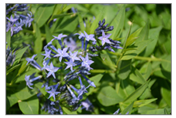
Blue Ice Star Flower flowers