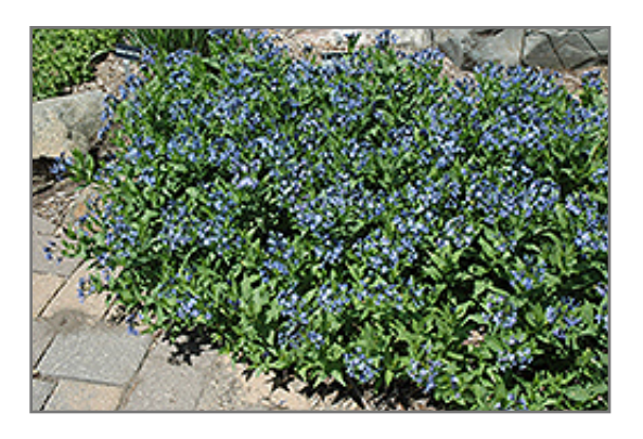
Blue Ice Star Flower in bloom