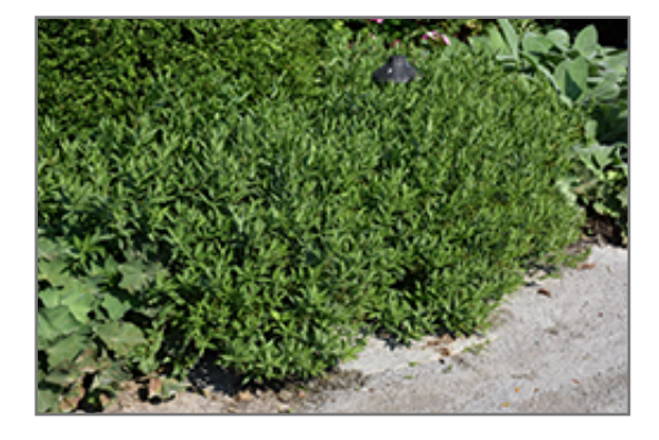
Blue Ice Star Flower