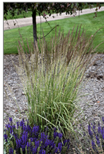
El Dorado Feather Reed Grass