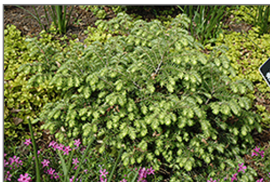
Moon Frost Hemlock