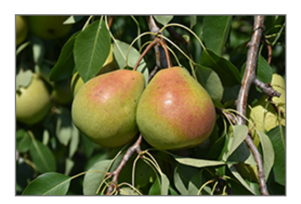
Parker Pear fruit

This is a dense deciduous tree with an upright spreading habit of growth. Its average texture blends into the landscape, but can be balanced by one or two finer or coarser trees or shrubs for an effective composition. This is a high maintenance plant that will require regular care and upkeep, and is best pruned in late winter once the threat of extreme cold has passed. Gardeners should be aware of the following characteristic(s) that may warrant special consideration;