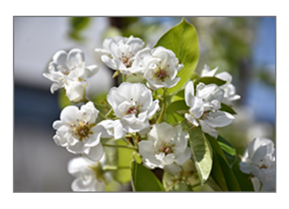
Parker Pear flowers