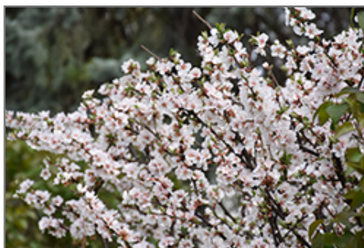
Nanking Cherry flowers

Nanking Cherry is covered in stunning fragrant shell pink flowers along the branches in early spring, which emerge from distinctive pink flower buds before the leaves. It has forest green deciduous foliage. The fuzzy pointy leaves turn yellow in fall. The fruits are showy cherry red drupes carried in abundance from early to mid summer.