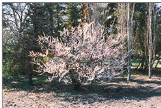
Nanking Cherry in bloom