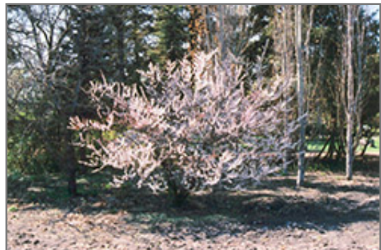
Nanking Cherry in bloom