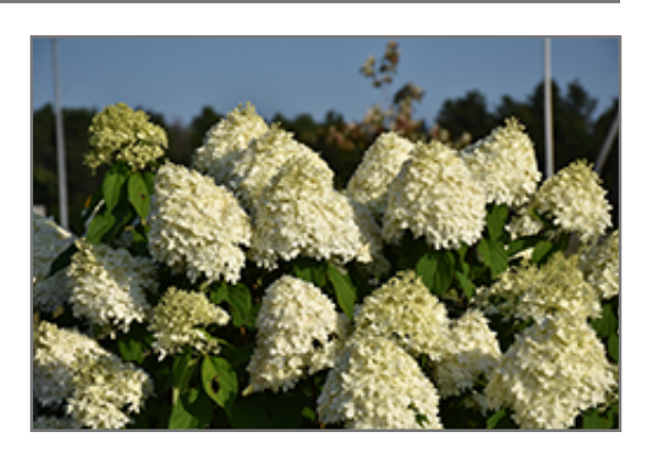
Limelight Hydrangea flowers