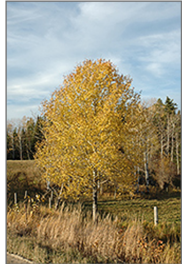
Trembling Aspen in fall

This tree should only be grown in full sunlight. It is an amazingly adaptable plant, tolerating both dry conditions and even some standing water. It is considered to be drought-tolerant, and thus makes an ideal choice for xeriscaping or the moisture-conserving landscape. It is not particular as to soil type or pH. It is quite intolerant of urban pollution, therefore inner city or urban streetside plantings are best avoided. This species is native to parts of North America.