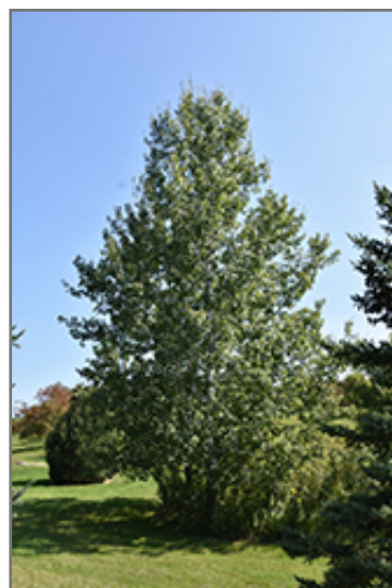
Trembling Aspen