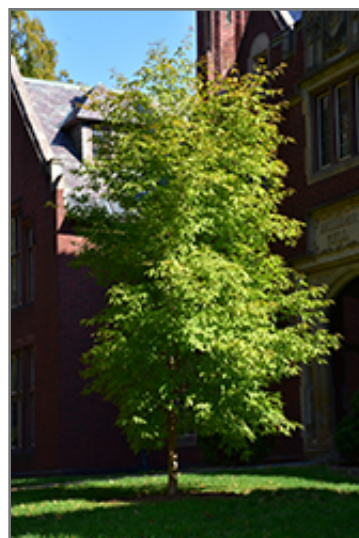
Three Flowered Maple

Three Flowered Maple will grow to be about 30 feet tall at maturity, with a spread of 30 feet. It has a low canopy with a typical clearance of 5 feet from the ground, and should not be planted underneath power lines. It grows at a slow rate, and under ideal conditions can be expected to live for 70 years or more.