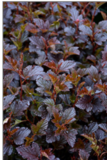
Petite Plum Ninebark foliage