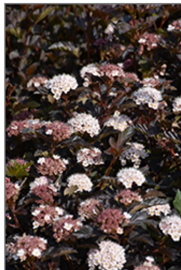
Petite Plum Ninebark flowers

Petite Plum Ninebark will grow to be about 6 feet tall at maturity, with a spread of 5 feet. It has a low canopy, and is suitable for planting under power lines. It grows at a medium rate, and under ideal conditions can be expected to live for approximately 30 years.