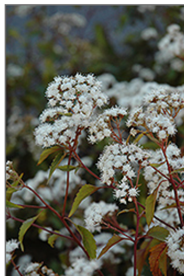
Chocolate Boneset flowers