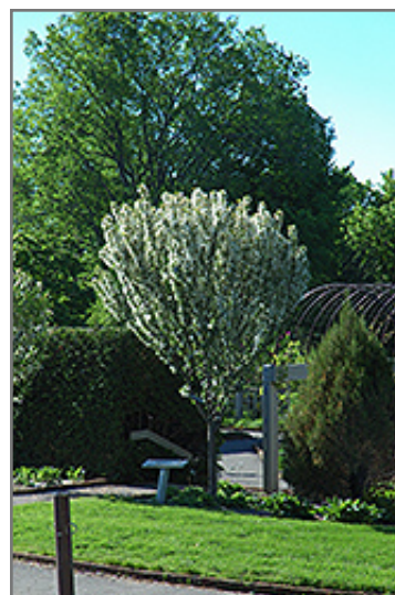
Adirondack Flowering Crab in bloom