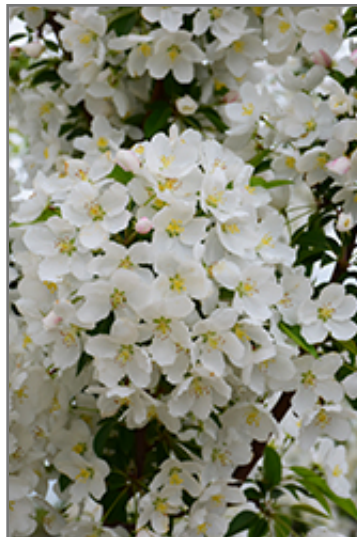
Adirondack Flowering Crab flowers