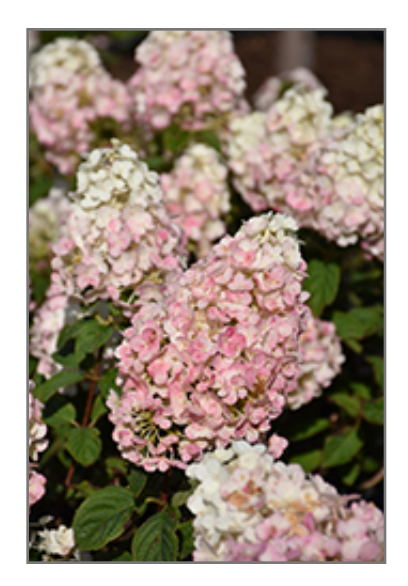
Strawberry Sundae Hydrangea flowers