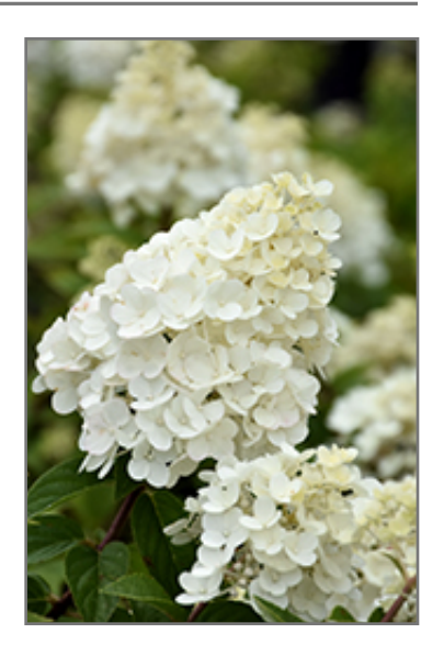
Strawberry Sundae Hydrangea flowers

Strawberry Sundae Hydrangea makes a fine choice for the outdoor landscape, but it is also well-suited for use in outdoor pots and containers. With its upright habit of growth, it is best suited for use as a 'thriller' in the 'spiller-thriller-filler' container combination; plant it near the center of the pot, surrounded by smaller plants and those that spill over the edges. It is even sizeable enough that it can be grown alone in a suitable container. Note that when grown in a container, it may not perform exactly as indicated on the tag - this is to be expected. Also note that when growing plants in outdoor containers and baskets, they may require more frequent waterings than they would in the yard or garden. Be aware that in our climate, most plants cannot be expected to survive the winter if left in containers outdoors, and this plant is no exception. Contact our experts for more information on how to protect it over the winter months.