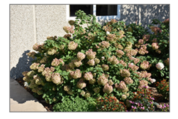
Strawberry Sundae Hydrangea in bloom