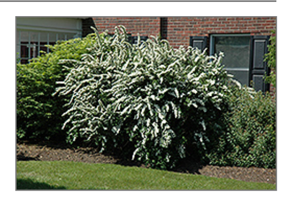
Renaissance Spirea in bloom