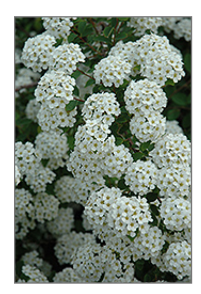
Renaissance Spirea flowers