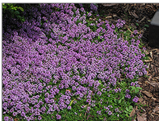
Purple Carpet Creeping Thyme in bloom