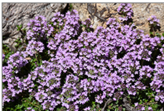
Purple Carpet Creeping Thyme flowers

Purple Carpet Creeping Thyme is recommended for the following landscape applications;