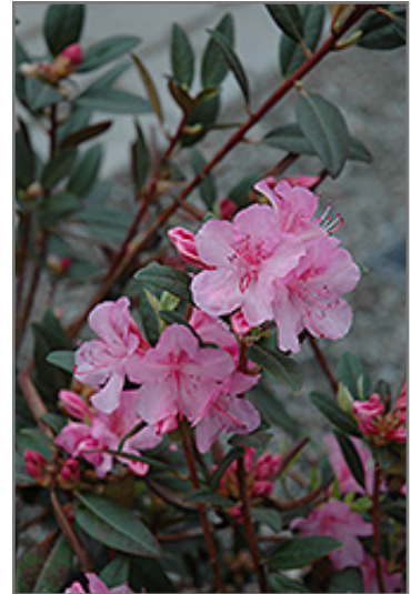
Aglo Rhododendron flowers

Aglo Rhododendron will grow to be about 3 feet tall at maturity, with a spread of 3 feet. It has a low canopy. It grows at a slow rate, and under ideal conditions can be expected to live for 40 years or more.