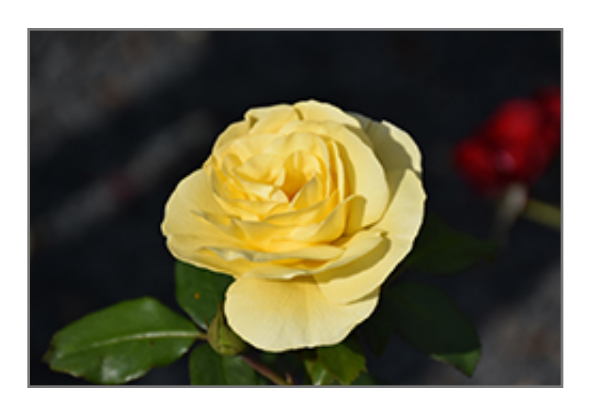
High Voltage Rose flowers