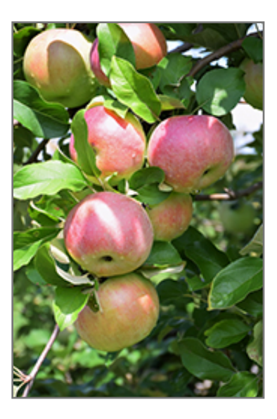
Northern Spy Apple fruit