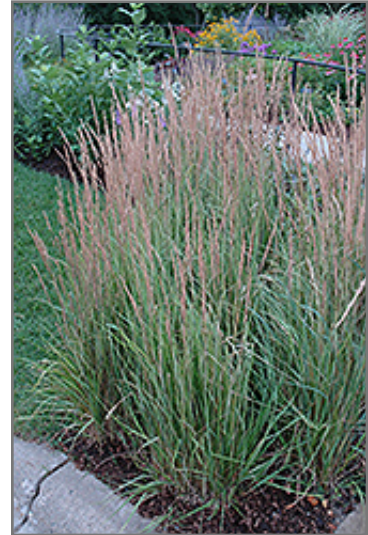
Variegated Reed Grass in bloom

This plant will require occasional maintenance and upkeep, and is best cut back to the ground in late winter before active growth resumes. It has no significant negative characteristics.