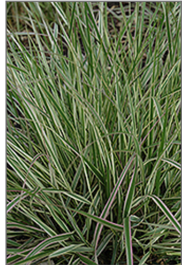
Variegated Reed Grass foliage