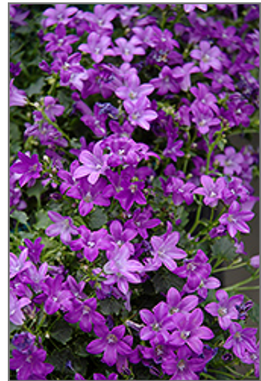
Get Mee Dalmatian Bellflower flowers