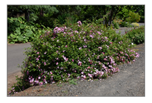
Oso Easy Fragrant Spreader Rose in bloom