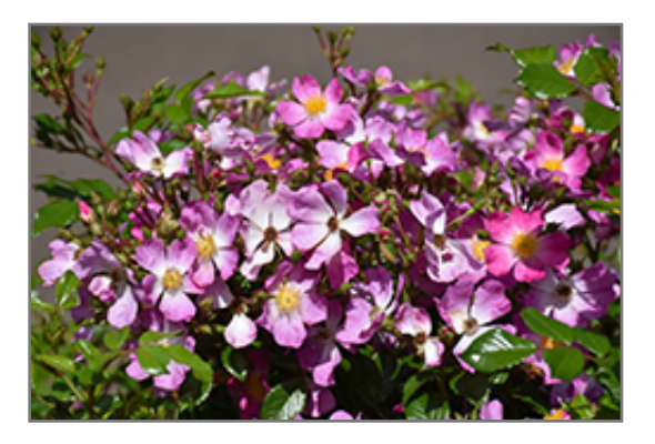
Oso Easy Fragrant Spreader Rose flowers

Oso Easy Fragrant Spreader Rose is recommended for the following landscape applications;