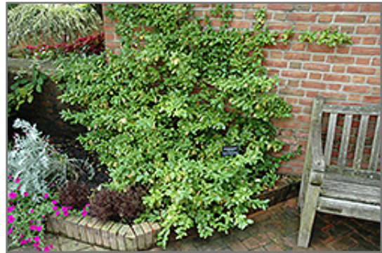
Sarcoxie Wintercreeper