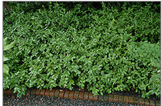
Sarcoxie Wintercreeper