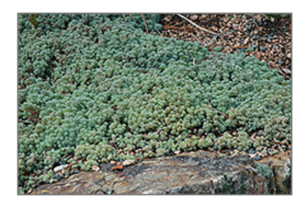
Spanish Stonecrop