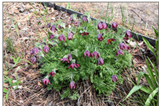
Burgundy Pasqueflower in bloom