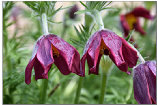
Burgundy Pasqueflower flowers