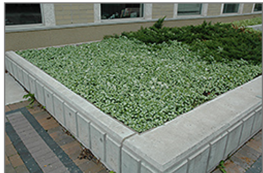
White Nancy Spotted Dead Nettle in bloom