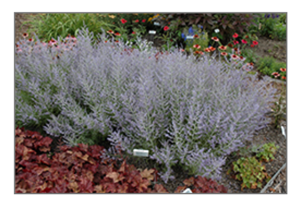
Peek-A-Blue Russian Sage in bloom

Peek-A-Blue Russian Sage is recommended for the following landscape applications;