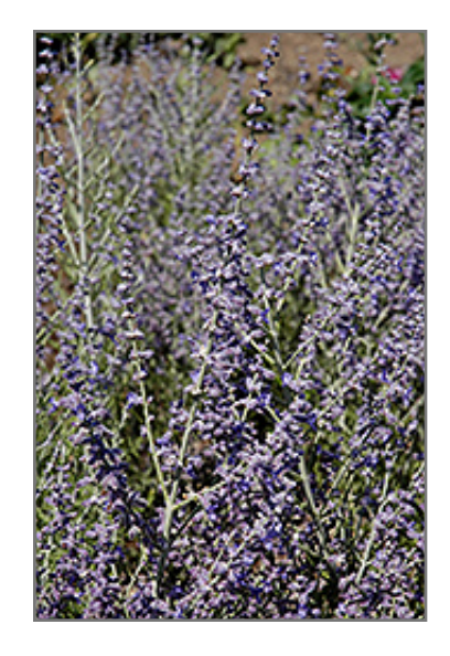
Peek-A-Blue Russian Sage flowers