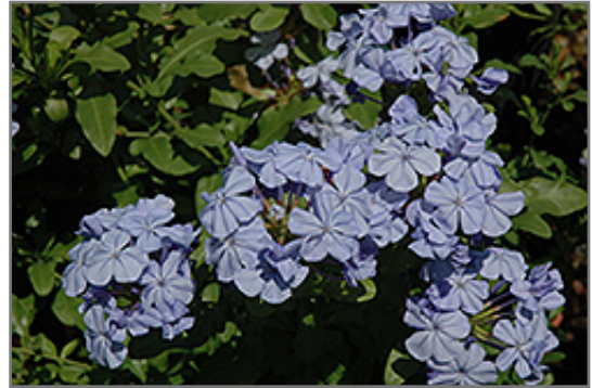
Dark Blue Plumbago flowers