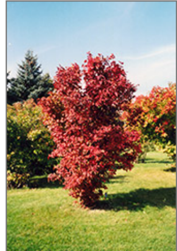
Onondaga Viburnum in fall

This shrub does best in full sun to partial shade. It prefers to grow in average to moist conditions, and shouldn't be allowed to dry out. It is not particular as to soil type or pH. It is highly tolerant of urban pollution and will even thrive in inner city environments. This is a selected variety of a species not originally from North America.