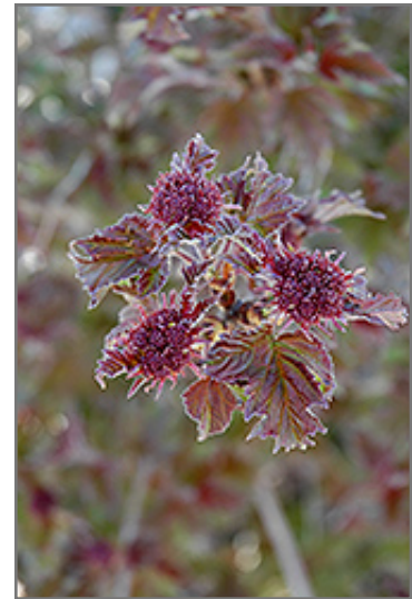
Onondaga Viburnum foliage