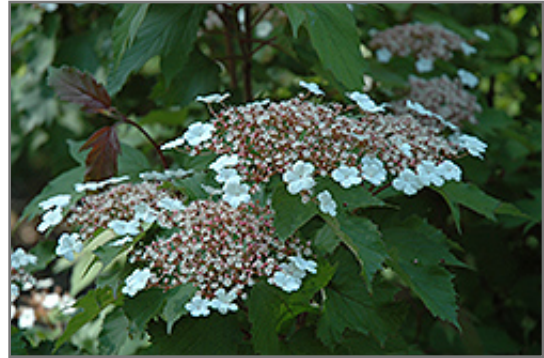
Onondaga Viburnum flowers

Onondaga Viburnum is a multi-stemmed deciduous shrub with a more or less rounded form. Its relatively coarse texture can be used to stand it apart from other landscape plants with finer foliage.