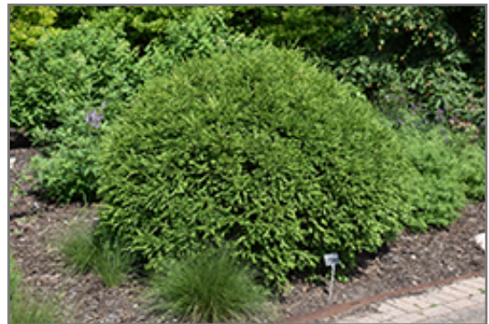
Green Gem Boxwood