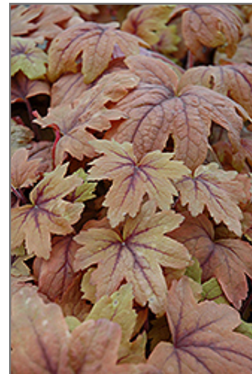
Sweet Tea Foamy Bells foliage