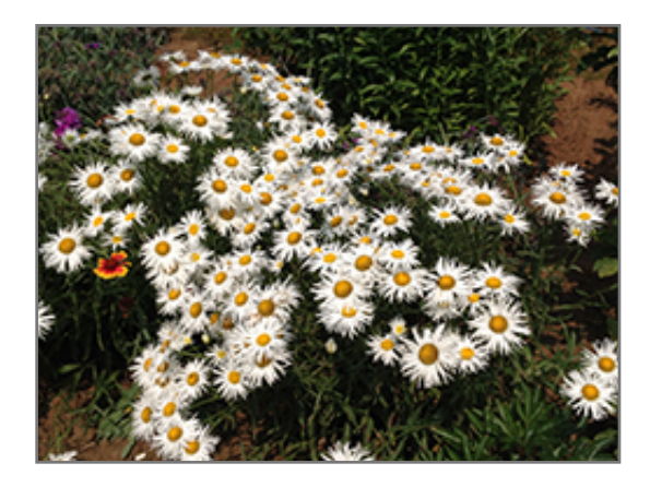
Crazy Daisy Shasta Daisy in bloom