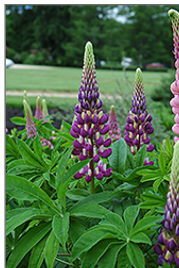
Russell Blue Lupine flowers

This plant does best in full sun to partial shade. It does best in average to evenly moist conditions, but will not tolerate standing water. It is not particular as to soil pH, but grows best in clay soils. It is somewhat tolerant of urban pollution. This particular variety is an interspecific hybrid, and parts of it are known to be toxic to humans and animals, so care should be exercised in planting it around children and pets.