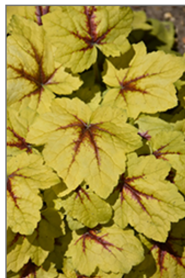
Catching Fire Foamy Bells foliage