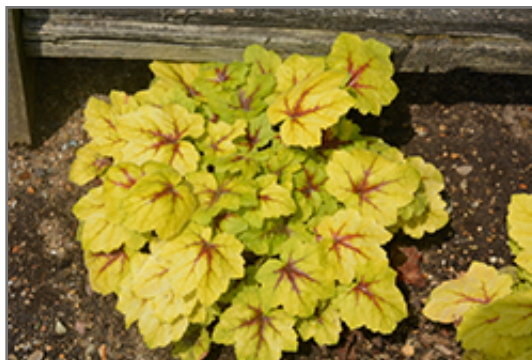
Catching Fire Foamy Bells

Catching Fire Foamy Bells is recommended for the following landscape applications;