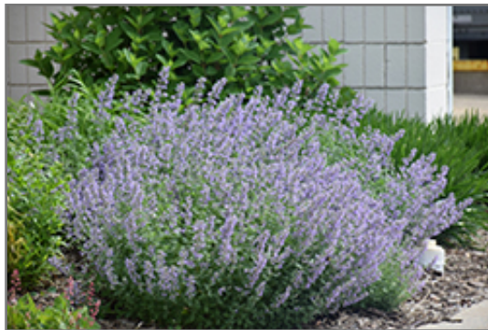
Cat's Meow Catmint in bloom