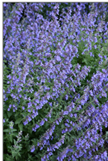
Cat's Meow Catmint flowers