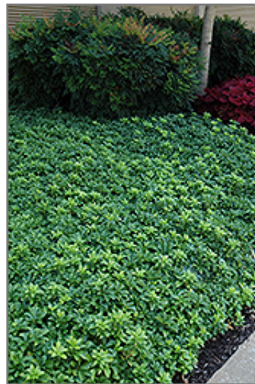
Green Sheen Japanese Spurge