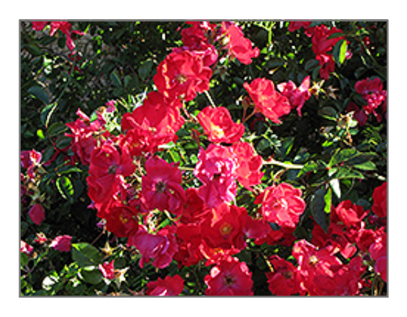
Flower Carpet Red Rose flowers