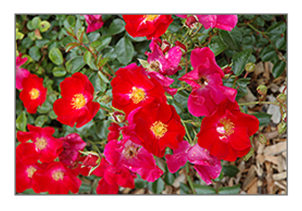
Flower Carpet Red Rose flowers

Flower Carpet Red Rose is a dense multi-stemmed deciduous shrub with an upright spreading habit of growth. Its average texture blends into the landscape, but can be balanced by one or two finer or coarser trees or shrubs for an effective composition.