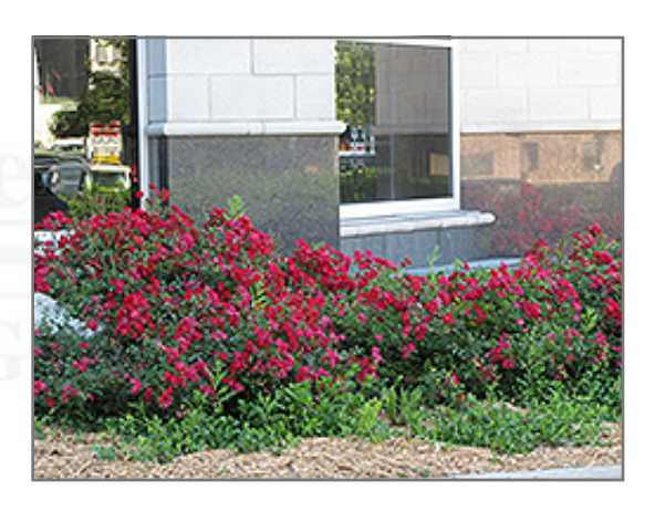
Flower Carpet Red Rose in bloom