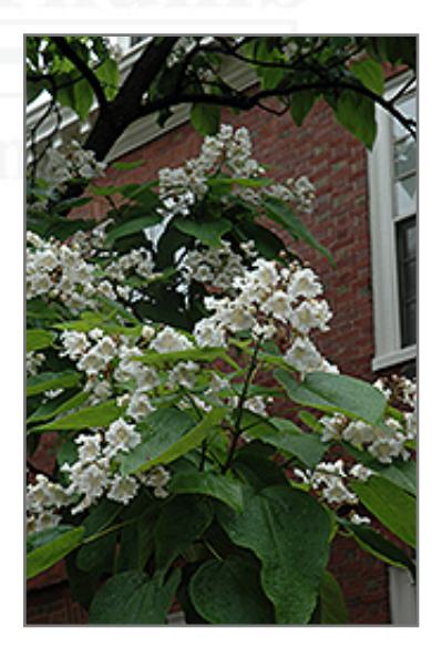
Northern Catalpa flowers