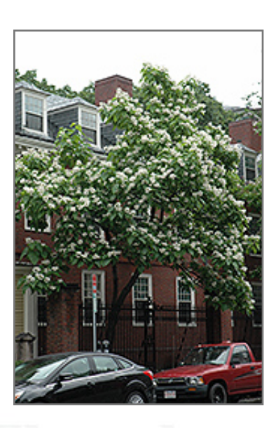
Northern Catalpa in bloom

This tree does best in full sun to partial shade. It is an amazingly adaptable plant, tolerating both dry conditions and even some standing water. It is considered to be drought-tolerant, and thus makes an ideal choice for xeriscaping or the moisture-conserving landscape. It is not particular as to soil type or pH, and is able to handle environmental salt. It is highly tolerant of urban pollution and will even thrive in inner city environments. This species is native to parts of North America.