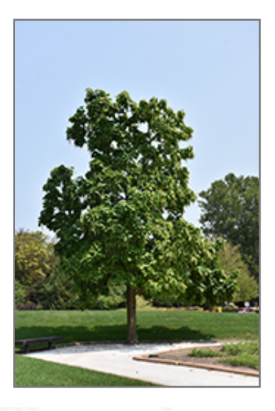
Northern Catalpa

This tree will require occasional maintenance and upkeep, and is best pruned in late winter once the threat of extreme cold has passed. It is a good choice for attracting hummingbirds to your yard, but is not particularly attractive to deer who tend to leave it alone in favor of tastier treats. Gardeners should be aware of the following characteristic(s) that may warrant special consideration;