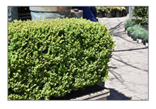
Green Mountain Boxwood

Green Mountain Boxwood is a dense multi-stemmed evergreen shrub with a shapely oval form. It lends an extremely fine and delicate texture to the landscape composition which can make it a great accent feature on this basis alone.