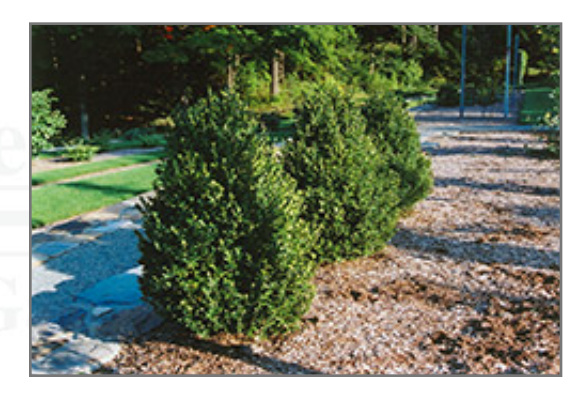
Green Mountain Boxwood

This is a relatively low maintenance shrub, and can be pruned at anytime. It is a good choice for attracting bees to your yard, but is not particularly attractive to deer who tend to leave it alone in favor of tastier treats. It has no significant negative characteristics.