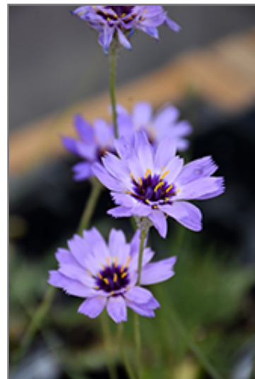
Cupid's Dart flowers

This is a relatively low maintenance plant, and is best cleaned up in early spring before it resumes active growth for the season. It is a good choice for attracting birds, bees and butterflies to your yard. It has no significant negative characteristics.