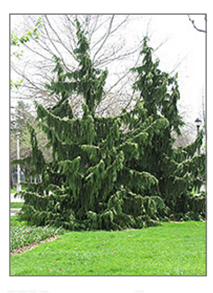
Nootka Cypress

Nootka Cypress is recommended for the following landscape applications;