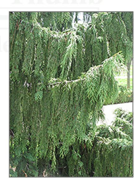
Nootka Cypress foliage