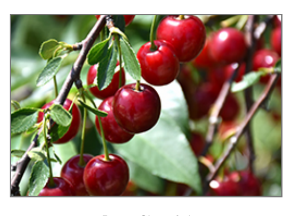
Romeo Cherry fruit