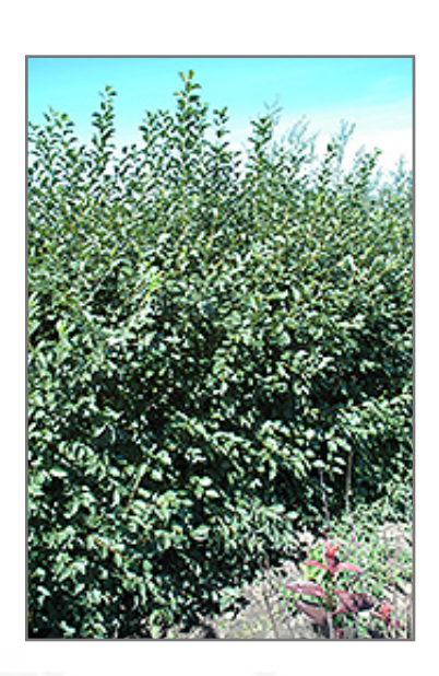
Romeo Cherry

This shrub is typically grown in a designated area of the yard because of its mature size and spread. It should only be grown in full sunlight. It does best in average to evenly moist conditions, but will not tolerate standing water. It is not particular as to soil type or pH. It is highly tolerant of urban pollution and will even thrive in inner city environments. This particular variety is an interspecific hybrid.