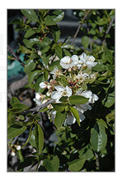
Romeo Cherry flowers