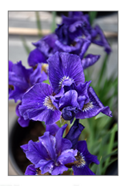
Ruffled Velvet Iris flowers

This plant will require occasional maintenance and upkeep, and should be cut back in late fall in preparation for winter. Deer don't particularly care for this plant and will usually leave it alone in favor of tastier treats. It has no significant negative characteristics.