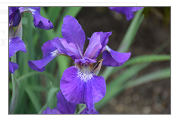
Ruffled Velvet Iris flowers