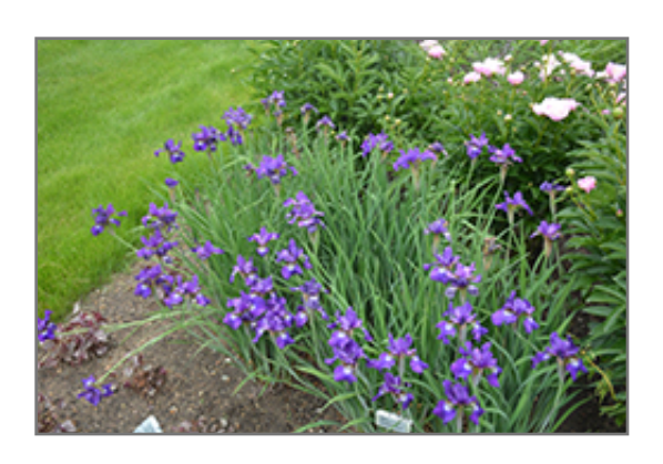
Ruffled Velvet Iris in bloom

Ruffled Velvet Iris will grow to be about 24 inches tall at maturity extending to 3 feet tall with the flowers, with a spread of 18 inches. When grown in masses or used as a bedding plant, individual plants should be spaced approximately 14 inches apart. It grows at a medium rate, and under ideal conditions can be expected to live for approximately 10 years. As an herbaceous perennial, this plant will usually die back to the crown each winter, and will regrow from the base each spring. Be careful not to disturb the crown in late winter when it may not be readily seen!