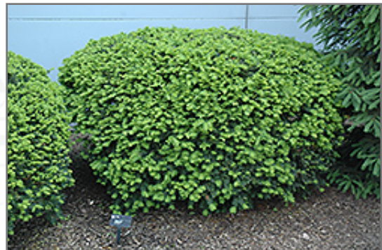
Densiformis Yew