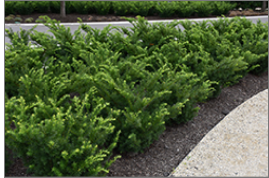
Densiformis Yew

Densiformis Yew is recommended for the following landscape applications;