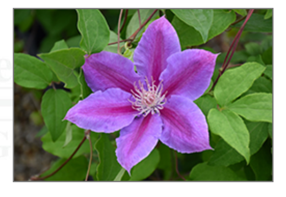
Dr. Ruppel Clematis flowers

This is a relatively low maintenance woody vine. It is a Type 2 clematis, which means it will bloom primarily on old wood of the previous season, with a second flush later in summer. Dead and weak vines should be removed in late winter, and remaining vines should be trimmed back to the first buds that are seen to remove dead stems. It is a good choice for attracting hummingbirds to your yard. It has no significant negative characteristics.