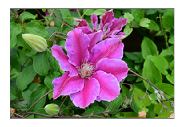
Dr. Ruppel Clematis flowers

Dr. Ruppel Clematis is a multi-stemmed deciduous woody vine with a twining and trailing habit of growth. Its average texture blends into the landscape, but can be balanced by one or two finer or coarser trees or shrubs for an effective composition.