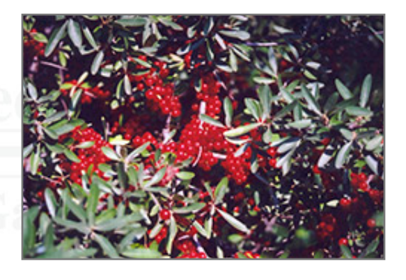
Silver Buffaloberry fruit