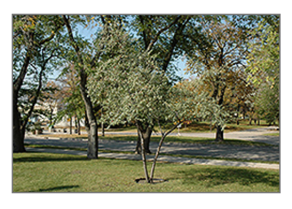
Silver Buffaloberry

Silver Buffaloberry has attractive silver deciduous foliage on a plant with a round habit of growth. The fuzzy narrow leaves are highly ornamental but do not develop any appreciable fall colour. It features subtle fragrant lemon yellow flowers along the branches in early spring. It produces red berries from late summer to early fall. The smooth brown bark and silver branches are extremely showy and add significant winter interest.